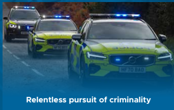
Relentless pursuit of criminality