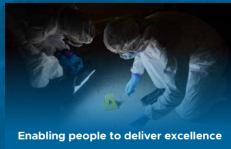
Enabling people to deliver excellence