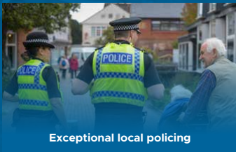
Exceptional local policing