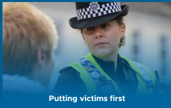
Putting victims first